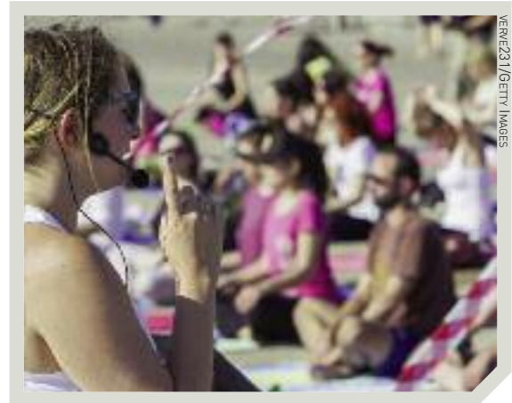
There is growing debate in the psychological literature over the 'authenticity' and construct-validity of mindfulness

Although these elements are invariably included in mindfulness interventions, one of the main strengths of MBIs is their versatility as the programme structure can be easily adapted to meet the needs of different population groups (e.g. shorter sessions/guided meditations for school-age children, greater psychoeducation component for clinicians and/or professionals, greater one-to-one discussion/therapeutic component for patients, etc.). A further strength of MBIs is their cost-effectiveness, with a typical eight-week intervention requiring as little as three facilitator hours per participant (i.e. based on 30 intervention hours delivered by one facilitator to 10 participants). As mindfulness is a non-pharmacological intervention, other strengths are that MBIs are generally considered to be non-invasive, and their secular delivery format means that they are acceptable to individuals from a diverse range of religious and cultural backgrounds (Shonin et al., 2013c).