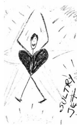
Figure 1. This is me (points). The sultry jet. I don't remember much about growing up except one time I was dancing as the Jet—it was anti-feminine. Black leather.

Not only did she eloquently describe her own experience in words, but she also drew pictures which conveyed a strong sense of the experience. The following are images from her, and from other group members, which give a sense of the group process and the creation of healing images and rituals (see Figures 1, 2 and 3).