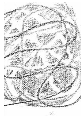
Figure 2. It was incredible being in the circle. I felt the energy. I have strong faith in all of us healing each other. It was exquisite; thank you everyone. Fire in these bones struggling to become free to stay free. Move lady move. I have to remember to breathe and move.

During the course of our groups, we noticed some